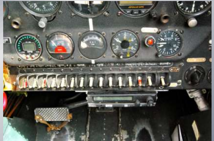
Rear instrument panel