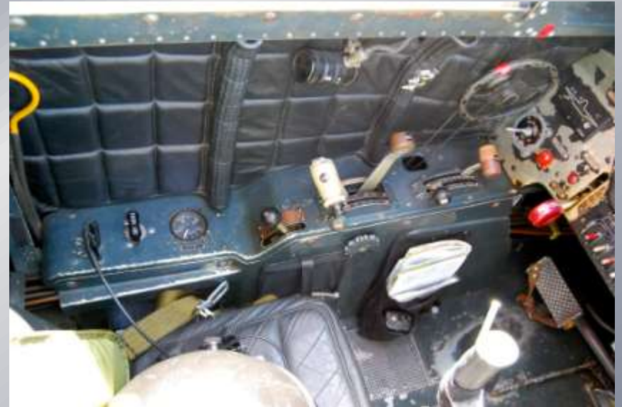
Side wall detail