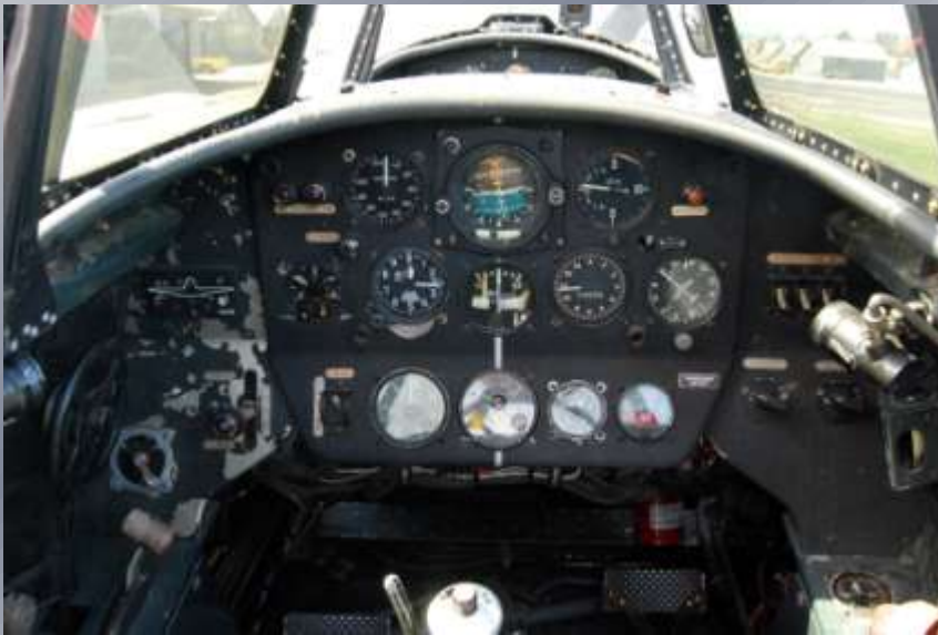
Front instrument panel